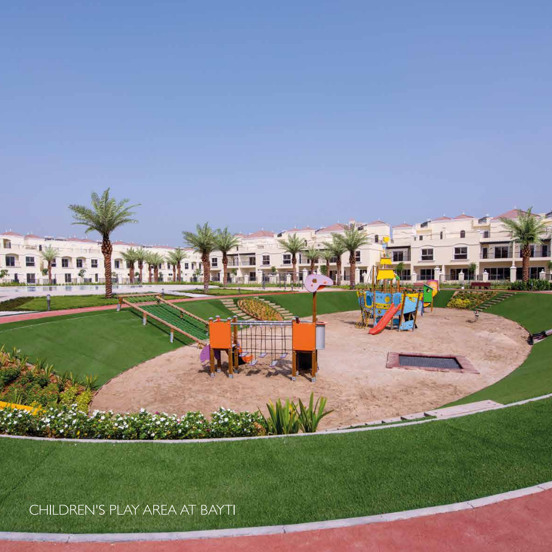
CHILDREN'S PLAY AREA AT BAYTI